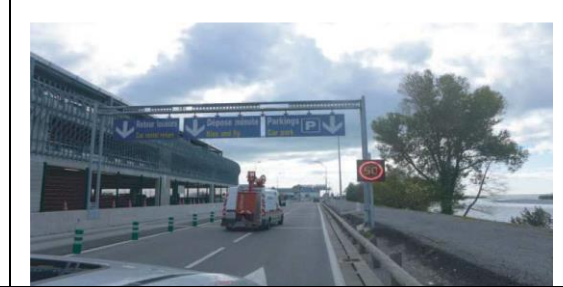
2. Follow Parking – keep right.