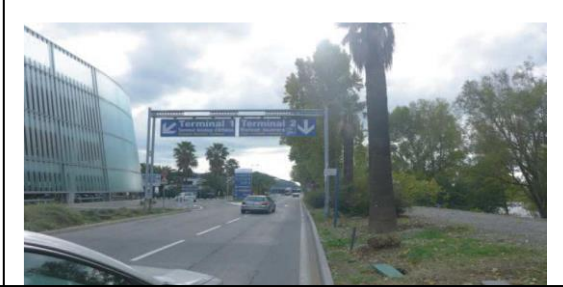
1. Nice Airport Azure direction Terminal 2.