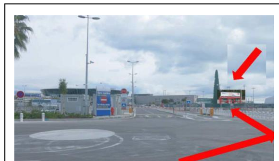
4. Enter through an automated gate then look for the (red) TT Car office.